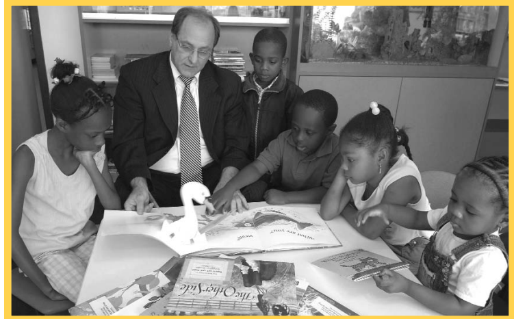
In August, faithful ROR supporter, Congressman Michael Capuano, read to children at Boston Medical Center, ROR's flagship program.