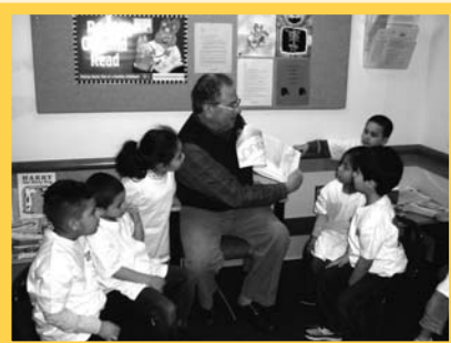
Rep. DeLeo reads to children at MGH-Revere Health Center in February.