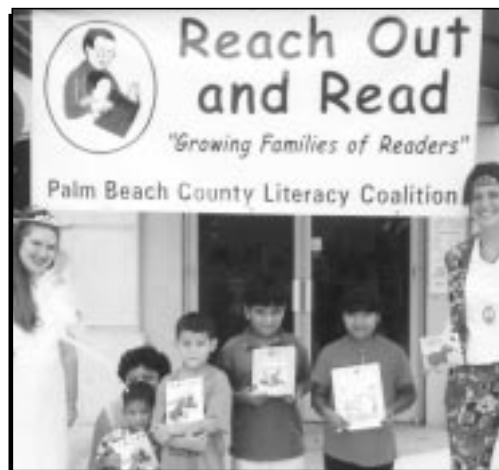
Children and AmeriCorps members gather in celebration of the expansion of ROR in Palm Beach County.

In our ongoing effort to raise the profile of the program among legislators, we are strongly encouraging ROR sites to invite legislators, particularly members of the House of Representatives, to visit their program this year - to see how it works, and how it's making an impact on families in their districts. This is a high priority for me, and I'd be delighted to guide any site in the planning and orchestration of such an event. Let me know how I can help!