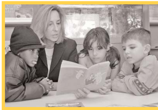
Lt. Gov. Kerry Healey reads to children at Boston Medical Center site visit.

At the same time that federal funding first became a reality for ROR, the Commonwealth of Massachusetts included $500,000 in matching state funding to spur broad implementation of this promising initiative. Today there are many exciting statewide partnerships that include public support, and many more are in the pipeline.