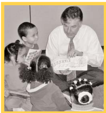
US Rep. Marty Meehan reads at Greater Lawrence Family Health Center.