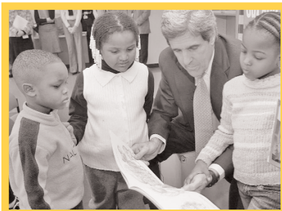
U.S. Senator John Kerry reads at Boston Medical Center

Over the past several months, ROR programs across the Commonwealth have played a pivotal role in helping ROR maintain its federal and state funding. How? By hosting their federal and local legislators at site visits. In the course of just 30-45 minutes, lasting and powerful impressions of the impact of ROR are created. When the time then comes to support funding for ROR, these legislators draw upon personal experience rather than just dry facts and figures as they decide which way to cast their vote.