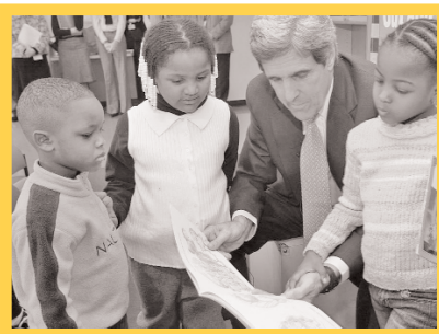
U.S. Senator John Kerry reads at Boston Medical Center

Over the past several months, ROR programs across the Commonwealth have played a pivotal role in helping ROR maintain its federal and state funding. How? By hosting their federal and local legislators at site visits. In the course of just 30-45 minutes, lasting and powerful impressions of the impact of ROR are created. When the time then comes to support funding for ROR, these legislators draw upon personal experience rather than just dry facts and figures as they decide which way to cast their vote.